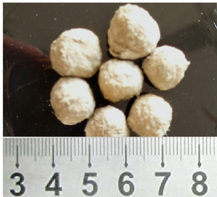
Fig.S2. Schematic diagram of the composite filler size